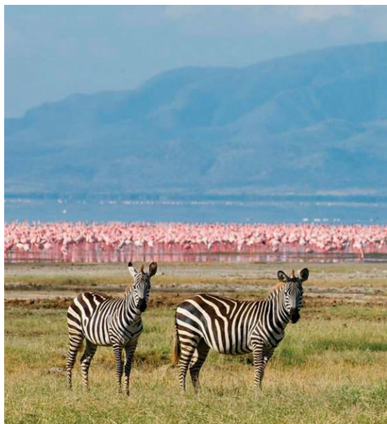
LAKE MANYARA TREE LODGE