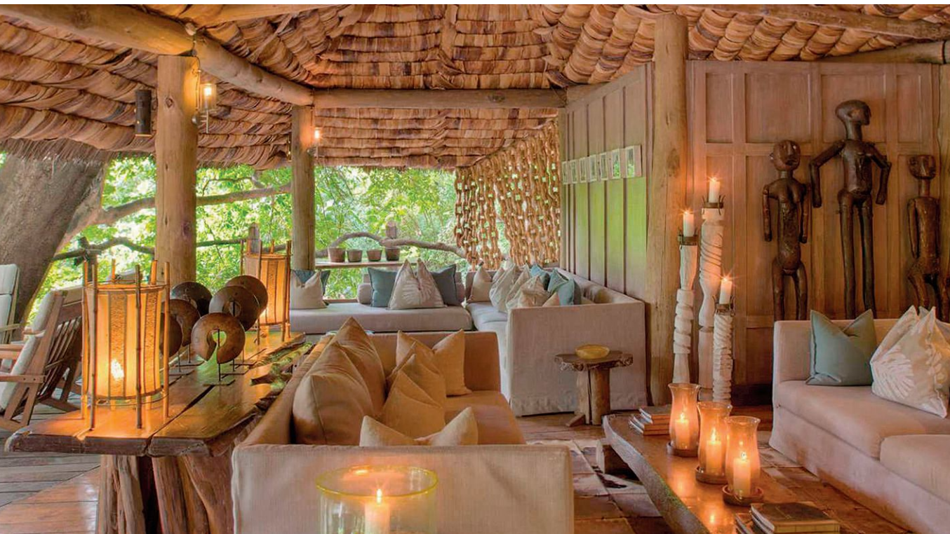
LAKE MANYARA TREE LODGE