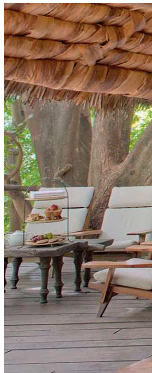
NORMAN CARR SAFARIS