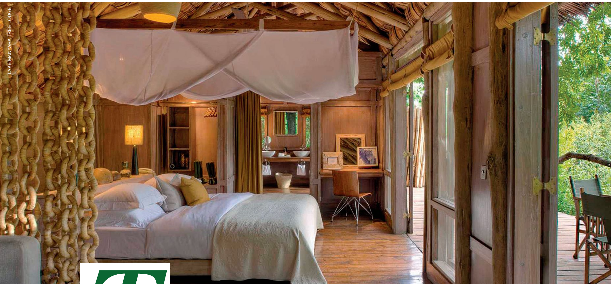
LAKE MANYARA TREE LODGE