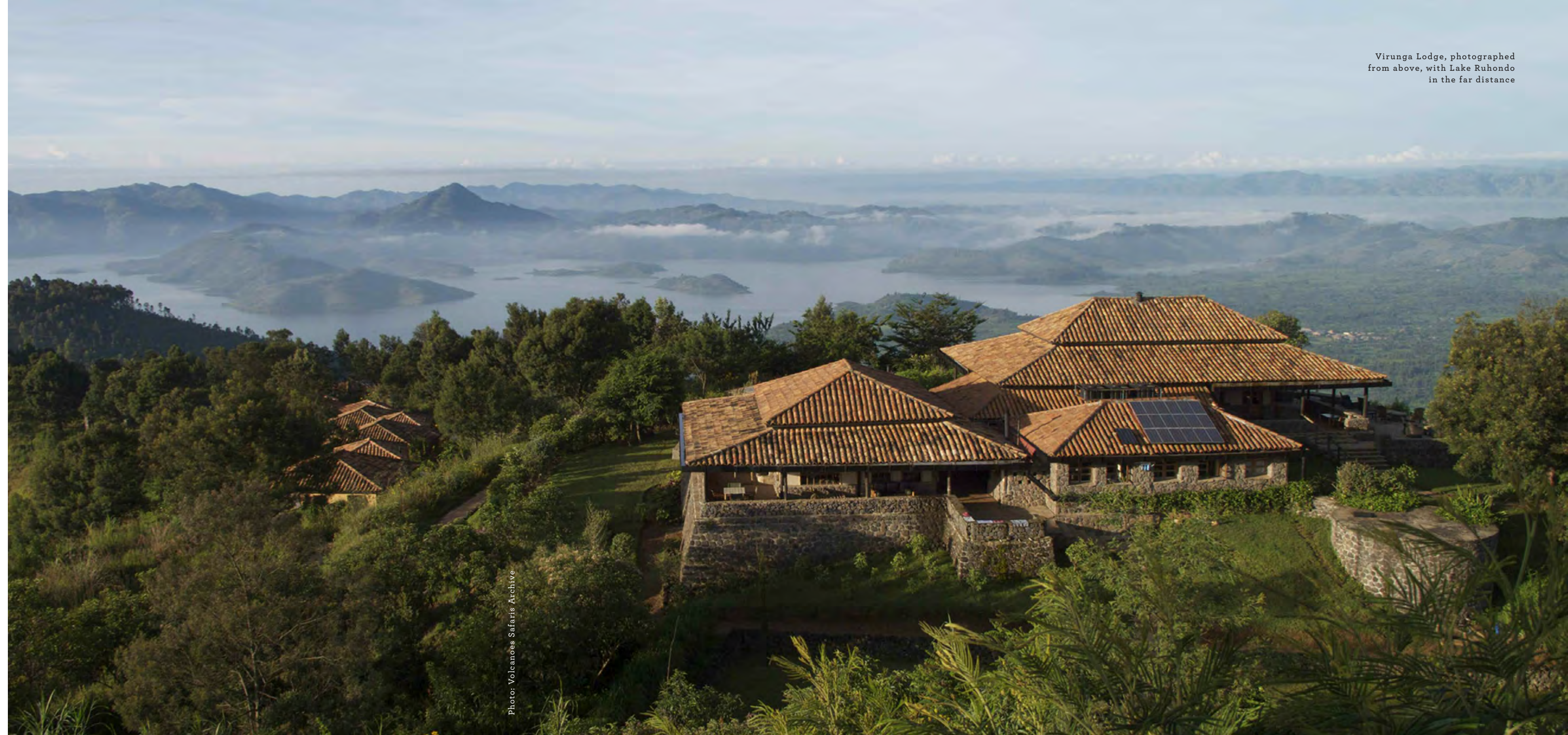
Virunga Lodge, photographed from above, with Lake Ruhondo in the far distance

In June 2004 we opened our first four cottages, or bandas , at Virunga Lodge. They were nothing fancy: large but simple rooms, locally made furniture, local kitenge cloth curtains, hurricane lamps, with very basic bathrooms (since getting water was a big issue, we had dry toilets and bush showers). But still, it was a very grand project on a very grand site while people around us were still struggling to survive.