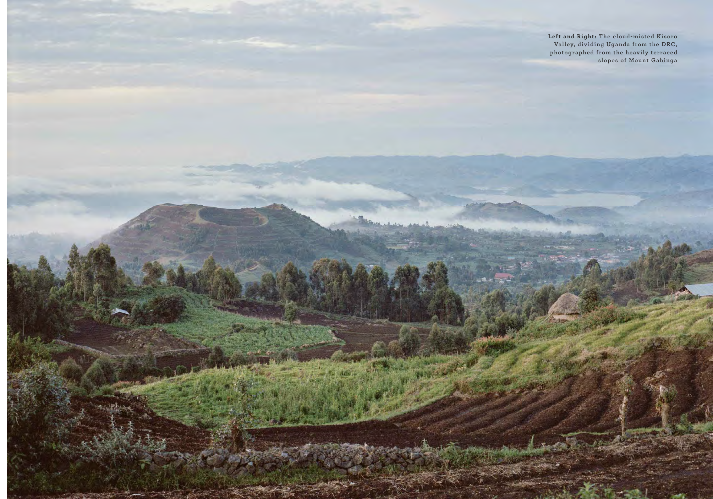
Left and Right: The cloud-misted Kisoro Valley, dividing Uganda from the DRC, photographed from the heavily terraced slopes of Mount Gahinga

That summer I tried to fly out to Rwanda to do voluntary relief work. It didn't work out. In 1995, I travelled to the Ugandan side of the Virungas for the first time since childhood. It was both magical and anguishing. This is when I recognised I couldn't not work in this part of the world. Although I had an ambiguous connection to Africa given what had happened to my family, I also had a strong empathy with what people had gone through; my mother's family had lived through the partition of India.